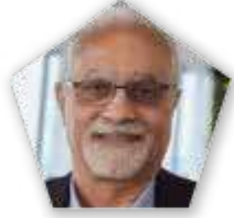
Dr Taher Elgamal Director, Arqit Ltd

Inventor of SSL, Security CTO Sales Force, Operating Partner, Evolution Equity Partners